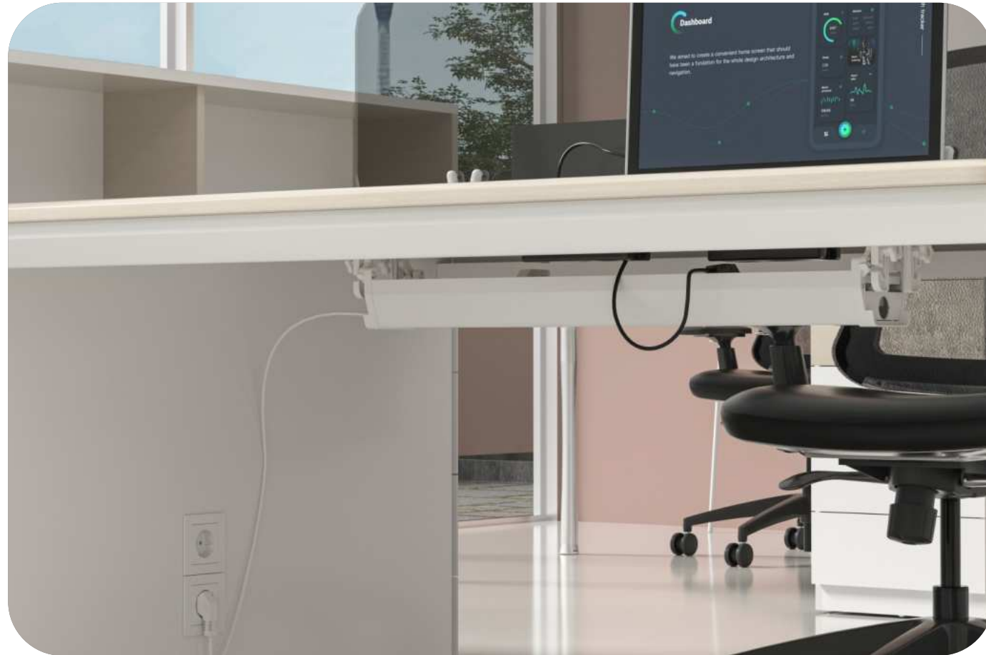
Co-working Spaces and Home Offices