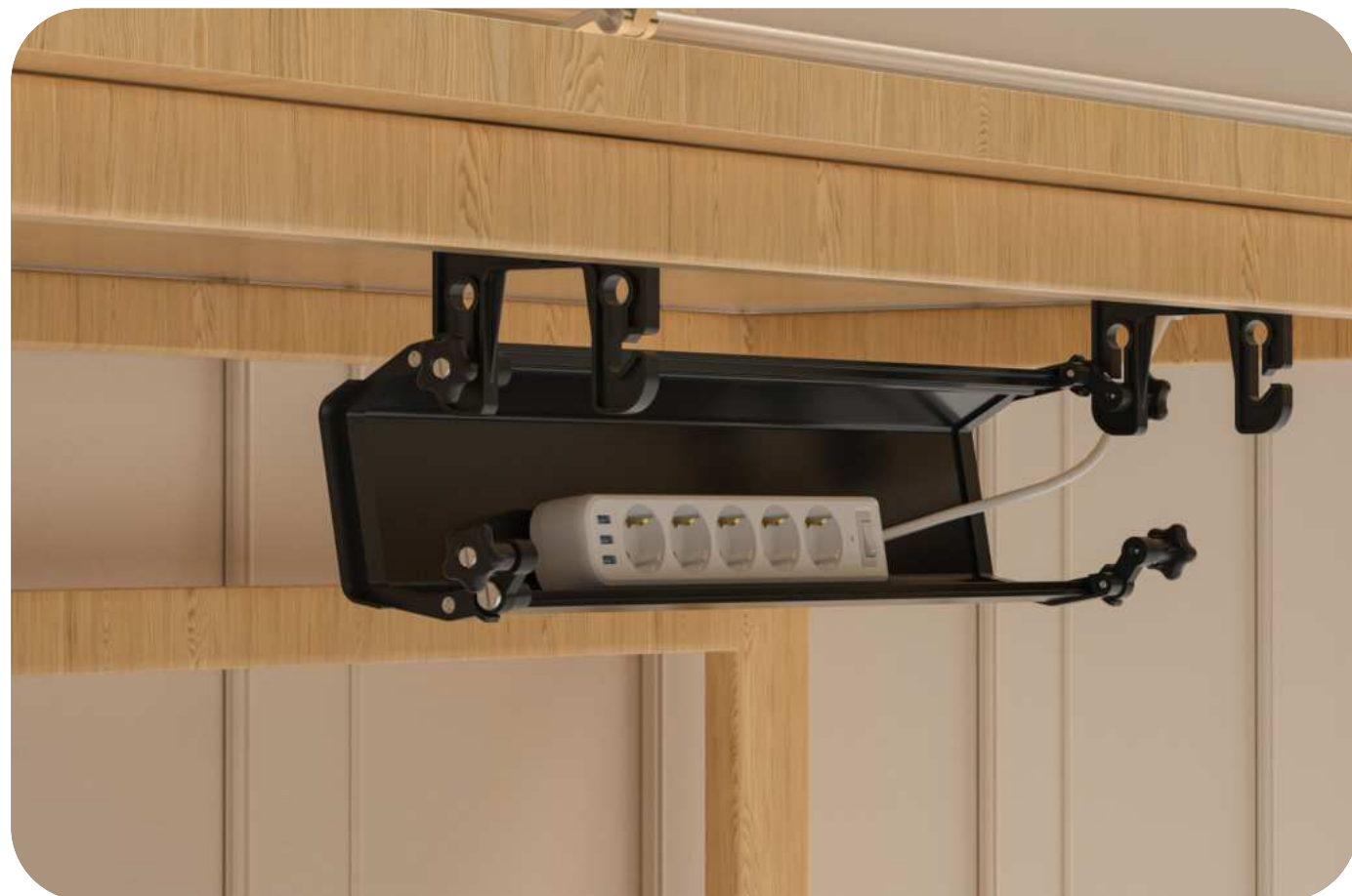
Product can be utilized as a cable management tray